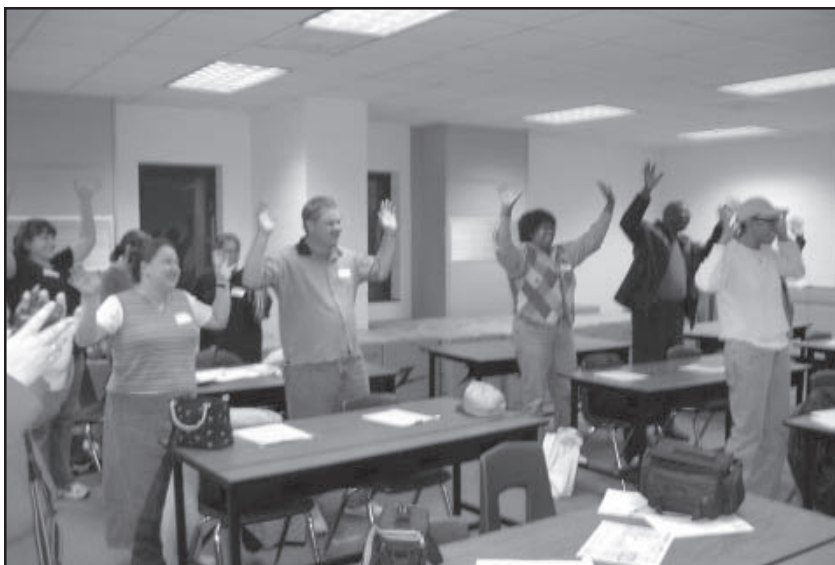
Pictured above are McBee area parents learning how to use music to teach their child in the Parenting and Life Skills Seminars. Forty-four parents participated in these workshops offered in the county.

PALSS (Parenting and Life Skills Seminars) attempts to break the cycle of poverty in Chesterfield County by providing empowering skill building seminars from which parents can walk away with the knowledge and ability to: (1) improve their employability; improve their personal financial management; (2) navigate the public assistance and social service system; (3) understand and manage their families' health; and (4) become an active partner in their children's academic experience. PALSS targets families living in poverty with children less than 5 years of age. There are 325 families in Chesterfield County meeting this discription. While no family in poverty with small children were turned away, families headed by single parents were aggressively recruited because they comprise approximately 70% of the target population. Families in poverty, with children less than 5 years of age were selected as target populations because statistical evidence suggests that children in poverty are less likely to succeed and are less likely to be ready for kindergarten or the first grade. PALSS is a six-week seminar with speakers from Employment Security Commission, DHEC, DSS, and the School District.